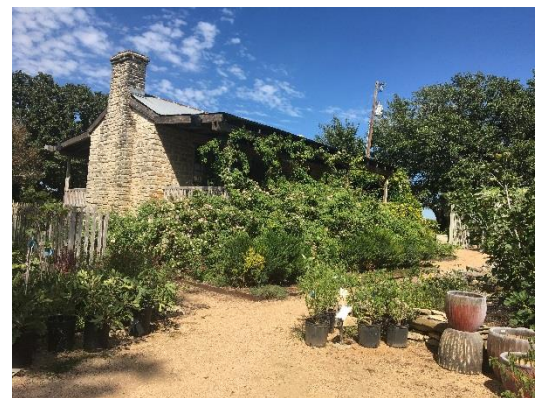
Much to see on the well-developed landscaped grounds.