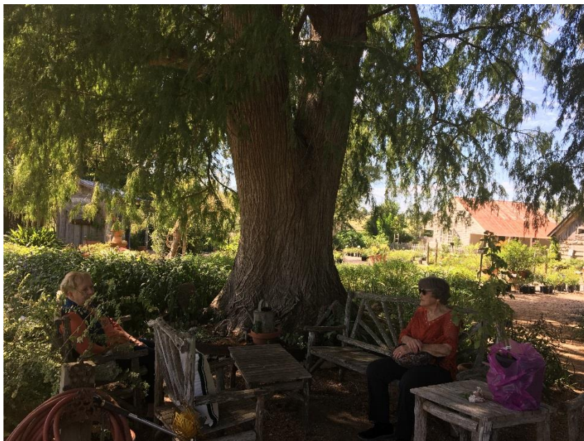
The large cypress tree provides refreshing shade.