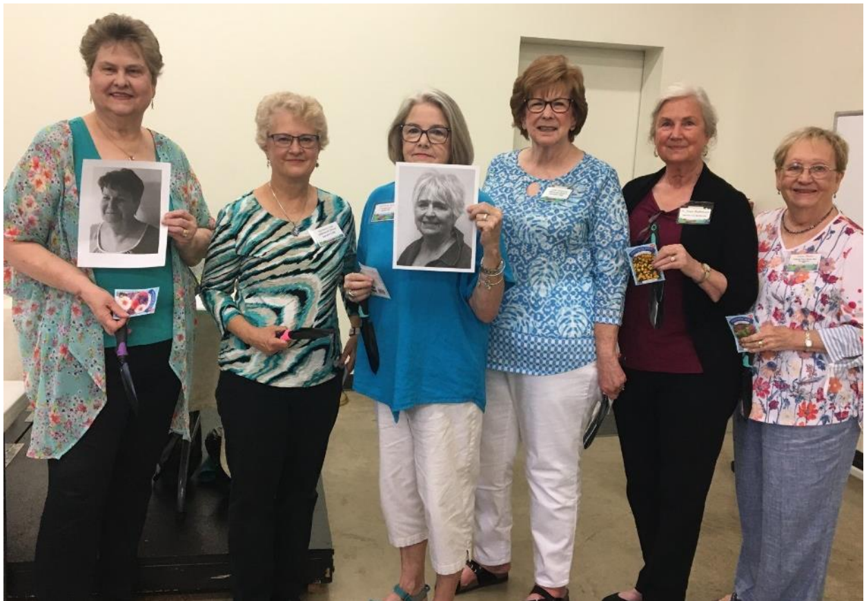
The executive Board of the LF Garden Club year 2023-2024