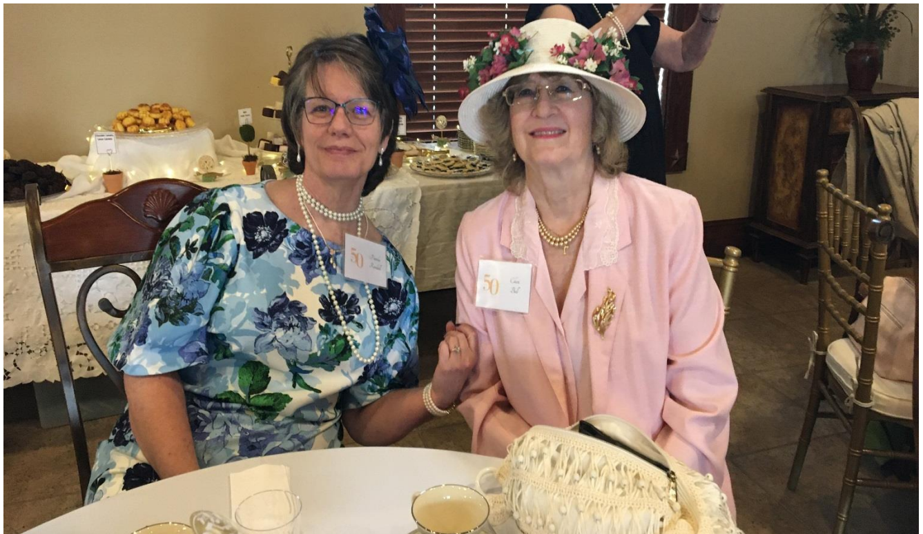
The noise of chatter ceased as everyone enjoyed the food. The melodic clinking of teacups could be heard.