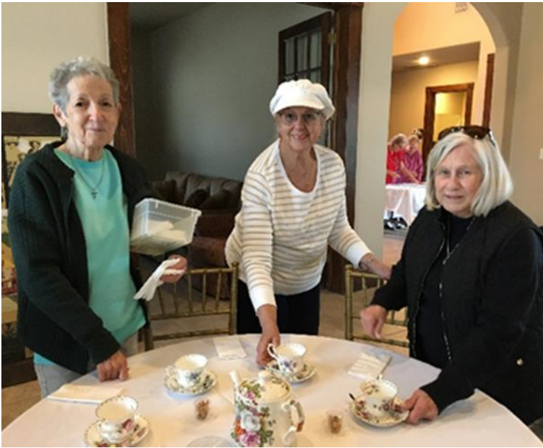
Each table had a different set of cups and plates.