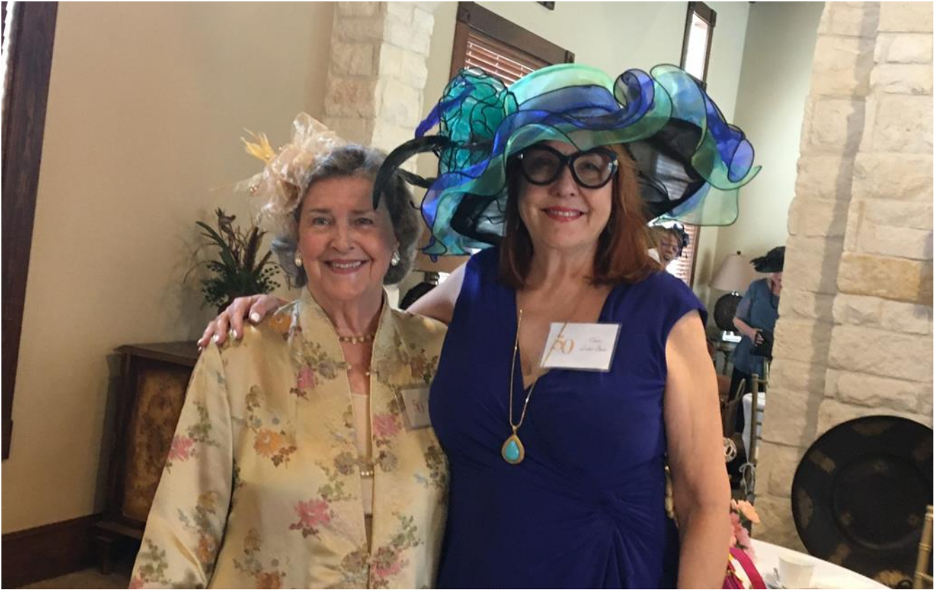
Some ladies wore their stylish hats to the 'High Tea'.