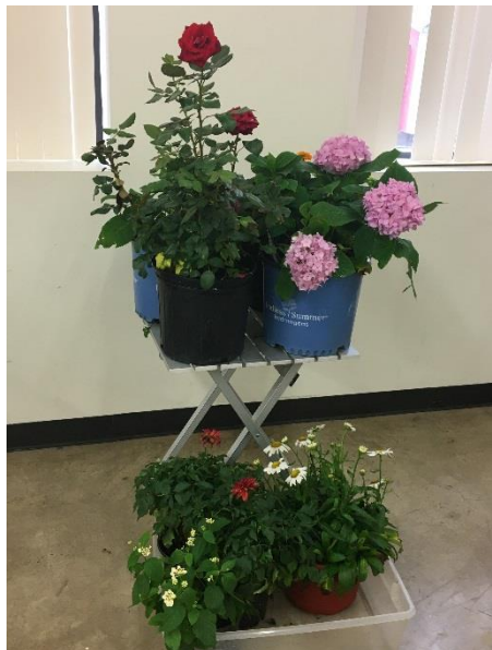
A cart with flowering plants awaited the program to come.