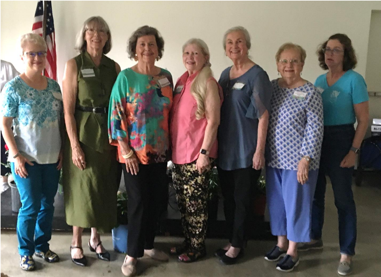
The new board of the LF garden club 2024-2025, ready to take on the challenges the new garden club year will bring.